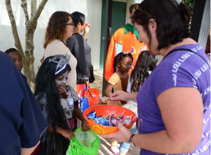
More pictures of Booville