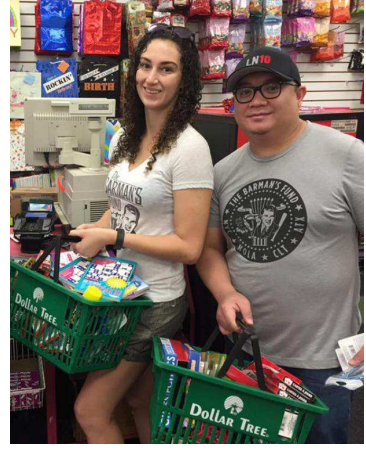
The Barman's Fund bought gifts for our teenagers who are sick and/

or in the hospital. Thank you so much for thinking about our kids and Angels' Place.